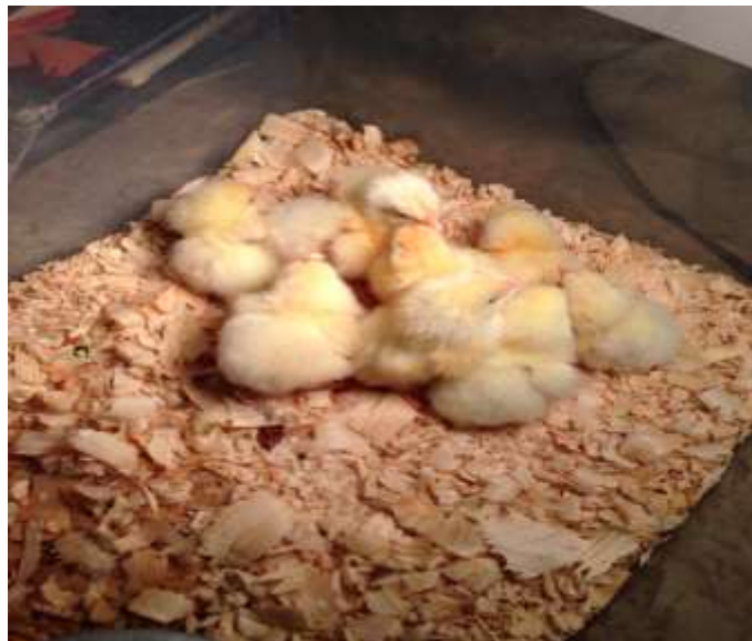
Here are our cute chicks that hatched!