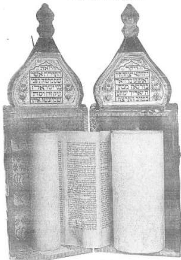
A Torah scroll in its decorated case, produced for a Jewish community in Iraq in the 19th century CE.

Sivan/Tammuz 5774 June, 2014 Vol 44, No. 8