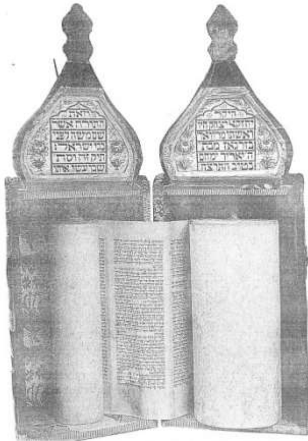
A Torah scroll in its decorated case, produced for a Jewish community in Iraq in the 19th century CE.

Sivan/Tammuz 5774 June, 2014 Vol 44, No. 8